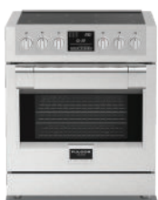
STAINLESS STEEL FSRC 3004 P MI ED 2F X

INDUKIT 4: Kit of 4 inductor discs for cooking with non-specific pans for induction