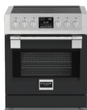
MATTE BLACK STEEL FSRC 3004 P MI ED 2F MBK